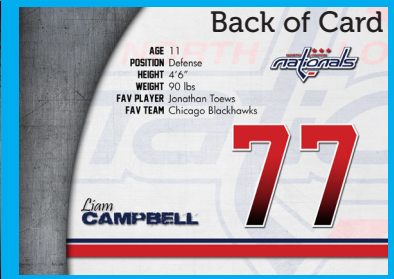
D Player Trading Cards Customized double-sided player trading cards with player's name, year, team logo, background and player bio.