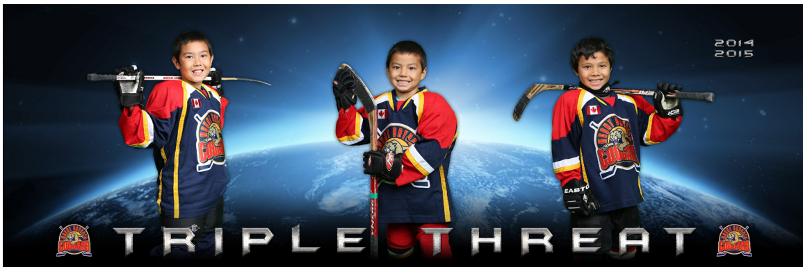
FN/GN/HN Multi Player Panoramic Choose from 2, 3, 4 & 5 player custom tailored panoramic prints. Our signature product!