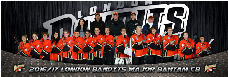
BN Panoramic Team Photo Dramatic team photo.