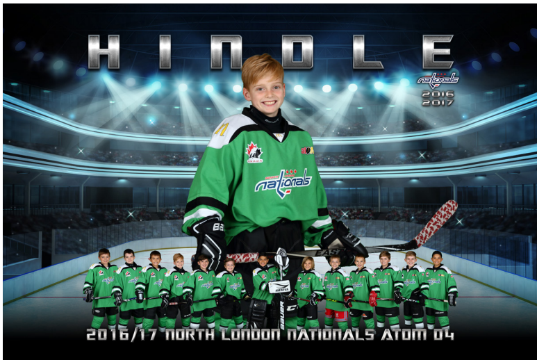
EN Poster Combo Epic team photo with a supersized player image and custom graphics and artwork.