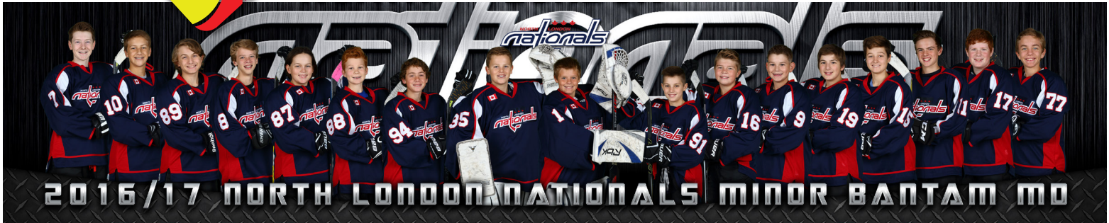
AN Super Pano Team Photo Epic super wide team photo.