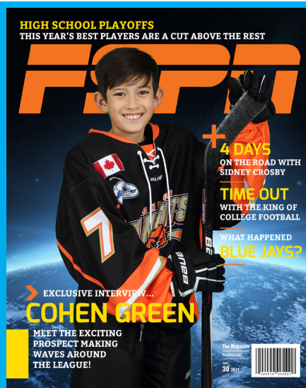
MC Magazine Cover Feature your star athlete on the cover of your own personalized magazine cover!