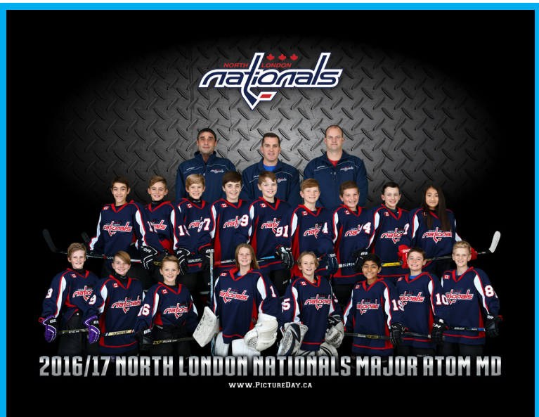
T Team Photo Your team's photo is creatively crafted by combining the individual images of every team member and making it picture perfect with Photoshop!