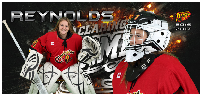
PN Panoramic Player Photo Wide player print with two poses.