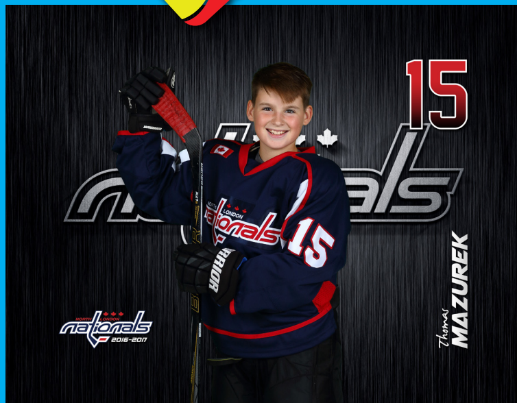
B Custom Player Photo Individualized player photo with player's name, year, team logo and choice of dramatic background.